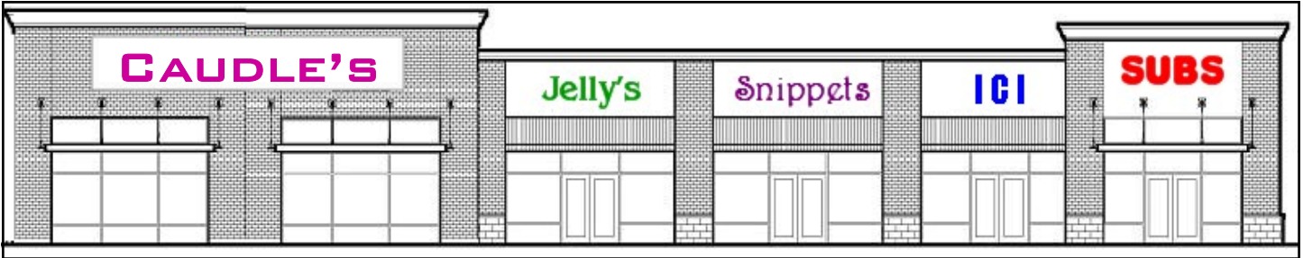
Typical Retail Center — Actual building design may vary.

NEW RETAIL CENTER ACROSS FROM WAL-MART 10,000 SF - Opening June 2006